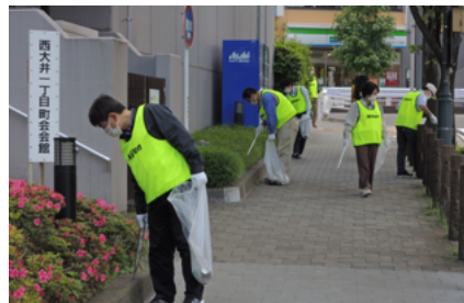
Cleanup near plant grounds (Nikon Oi Plant)