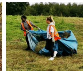
Grassland cleanup and ecosystem protection activity (Optos Plc)