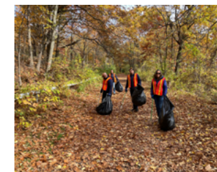
Park cleanup activity (Optos, Inc.)

These companies conducted cleanup activities at Worcester Park in Massachusetts, U.S.A., and grassland cleanup and local ecosystem protection activities at Fife Coast and Countryside Trust in the U.K.