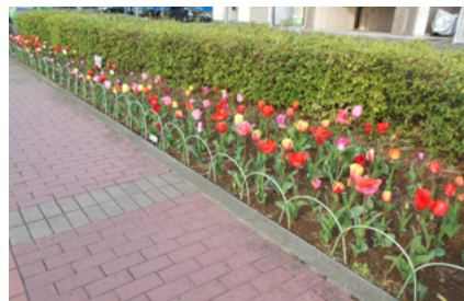
Tulips planted and cultivated by Yokohama Plant employees