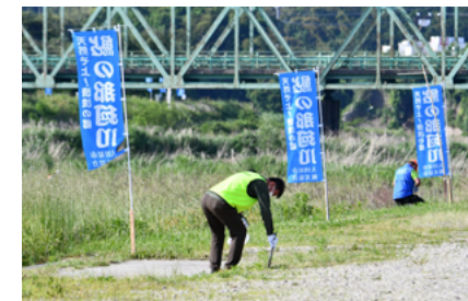
Cleaning Up the Banks of the Naka River (Tochigi Nikon Corp., Tochigi Nikon Precision Co., Ltd.)

These organizations undertake clean-up activities in the vicinity of each facility, and collaborated with a Tochigi Prefecture government-sponsored association for cleaning up the Naka River in line with the goal of "Realizing Zero Plastic Waste in our Forests, Countryside, Rivers and Lakes."