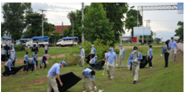
Cleanup activities around the plant (Nikon Lao Co., Ltd.)

Nikon (Thailand) and Nikon Lao conducted cleanup activities around their plants on World Environment Day, June 5, 2022. World Environment Day was established by the United Nations in 1973. Nikon (Thailand) distributed 200 zamiculcas saplings to employees and encouraged them to plant and grow trees around their homes.