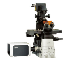
Confocal Microscope System "AX/AX R"

Capable of capturing an ultra-wide-field retinal image covering approximately 80% of the retina and a cross-sectional retinal image at any position in the ultra-wide-field image in one device.