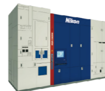
Semiconductor Lithography System "NSR-S635E"

Gen 8 Plate FPD Lithography System. Supporting panels for high value-added premium displays, such as smart devices, high-end monitors, and large TVs.