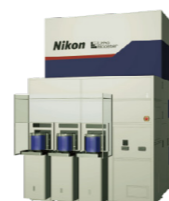
Alignment Station "Litho Booster"

Reduces the size of circuit patterns and projects them onto silicon wafers (semiconductor substrate) using ultra-high-resolution lenses.