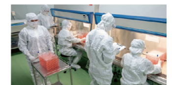
Cell & Gene Therapy Contact Development and Manufacturing

Providing world-class contract service to pharmaceutical and bio venture companies.