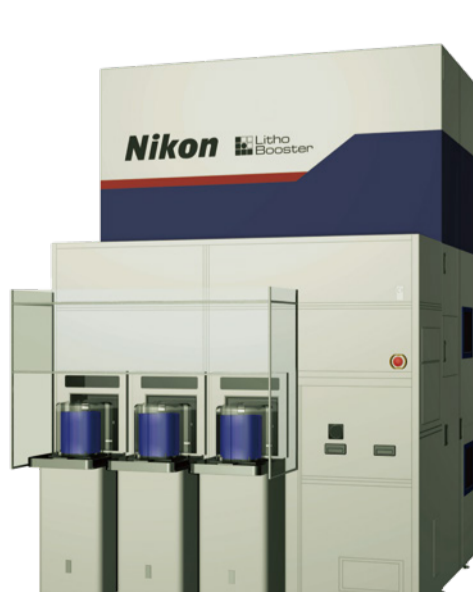
Alignment Station "Litho Booster"

Reduces the size of circuit patterns and projects them onto silicon wafers (semiconductor substrate) using ultra-high-resolution lenses.