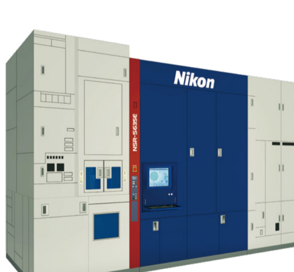
Semiconductor Lithography System "NSR-S635E"

Gen 8 Plate FPD Lithography System. Supporting panels for high value-added premium displays, such as smart devices, high-end monitors, and large TVs.