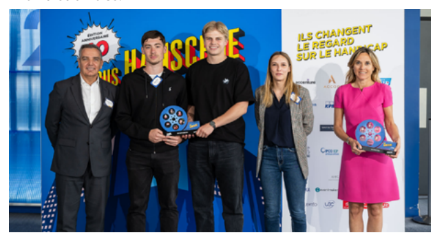
Contest is designed to expand learning opportunities for young people with disabilities

Since 2017, Nikon Europe B.V., France Branch has been a sponsor of Tous HanScène, a student video contest that conveys the reality of living with handicaps and students with disabilities.