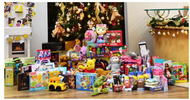
Gifts brought to the toy drive by employees

Each year during the holiday season, we hold a toy drive for underprivileged children. This charity event has grown in scale each year thanks to the dedication of our employees.