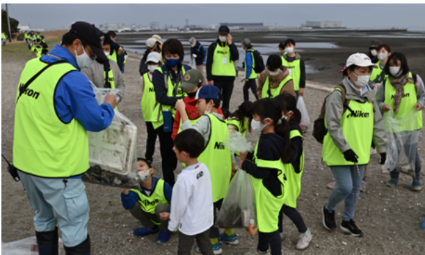
Nikon Vision's waterfront activities took place in March 2023. Along with bird watching on the mudflats, we also cleaned up the beach.