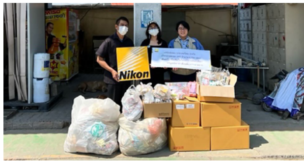
Paper cartons equivalent to two recycled roofs were collected and donated to organizations engaged in relief activities

Nikon collected used beverage paper packs from its employees and donated them to an activity to provide recycled roofs to people suffering from housing problems caused by natural disasters.