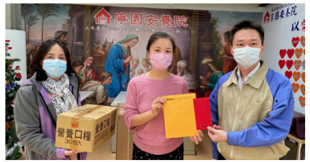
Nikon Precision Taiwan Ltd. employees delivering donations to welfare organizations

Every year, we support welfare organizations and children's homes through donations, and we also encourage employees to donate to these organizations and homes through matching gifts.