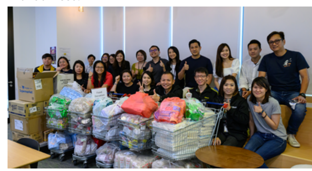
Food collected with employees participating in an in-house food drive

Held an in-house food drive. Unused and unused food items were brought together and donated to a non-profit organization that provides food assistance to people in financial need.