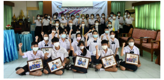
Scholarships in Thailand are provided through Shanti Volunteer Association in Japan and Sikkha Asia Foundation in Thailand. The photo above was taken at an awards ceremony in