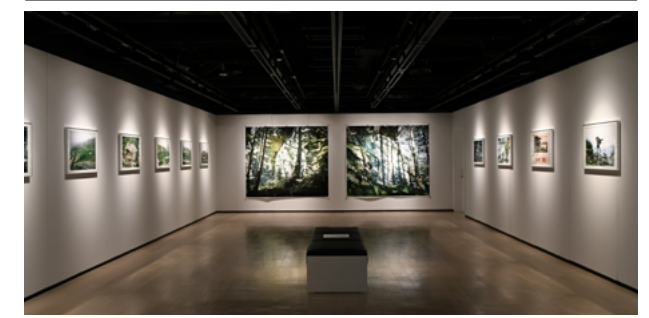
Nikon Salon, a photo exhibition space operated by Nikon Imaging Japan Inc.