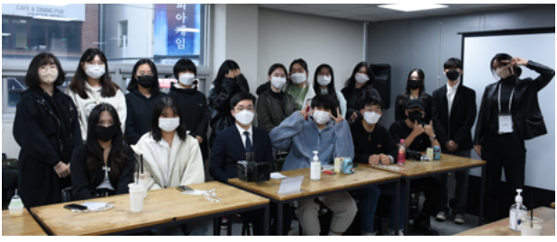
Young people participating in a photography workshop at the Daum Junior Photo Festival in Korea.