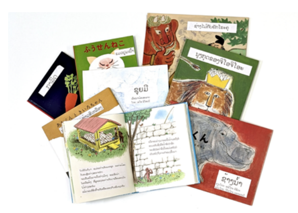
Picture book created by employee volunteers cutting and pasting Lao translations.

In Laos, children have limited access to books, and the country generally lacks the number and diversity of books and bookstores found in Japan. Understanding the situation, we launched this activity in the fiscal year 2017 as an educational support program from Japan to Laos, and we have continued these efforts for the past five years. During the fiscal year 2022, a total of 108 employees participated, delivering 272 picture books to Laos.