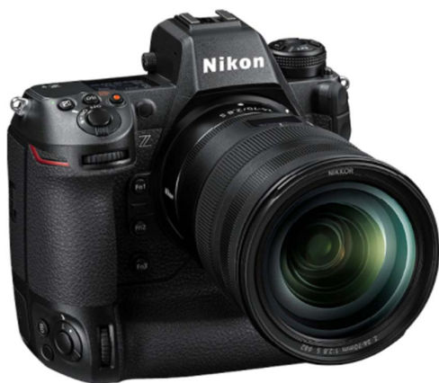
Fig. 1 Nikon Z 9

In December 2021, Nikon released its first flagship model, the Nikon Z 9, an FX-format mirrorless camera. This paper describes the various development elements of the Z 9.