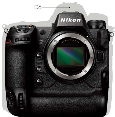
Fig. 6 Nikon Z 9, which is approximately 20% lower in volume than the D6

Menus with deep hierarchies tire professional users with repeated button presses because they take several pictures in a day. In such cases, the more buttons with a direct operation, the more the load on the photographer can be reduced. While meeting these needs, the Nikon Z 9 is approximately 20% lower in volume than the D6.