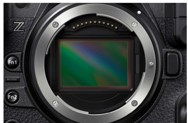
Fig. 5 Stacked Nikon FX format CMOS sensor

The Nikon Z 9 is equipped with a stacked CMOS image sensor with an effective 45.71 MP. The standard sensitivity is ISO 64 to 25600 and it can also be set to 1 EV (equivalent to ISO 32) below ISO 64 and to 2 EV (equivalent to ISO 102400) above ISO 25600. Auto ISO sensitivity control is also available. At high sensitivity, noise is processed at different