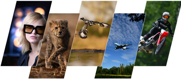
Fig. 2 Detectable subject images