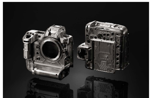
Fig. 7.2 Body incorporating magnesium alloy