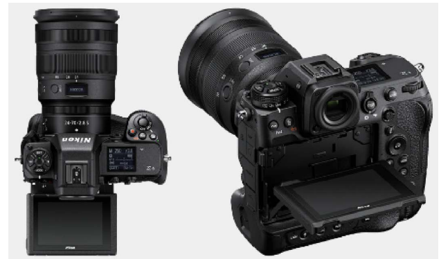
Fig. 7.1 Nikon's first four-axis tiltable image monitor with a high degree of angle freedom

scan rate, which suppresses rolling shutter distortion and eliminates the need for a mechanical shutter. This enables a large number of photos to be taken freely, without worrying about durability or the risk of malfunction, and eliminates dust from shutter wear. The optical filter in front of the image sensor is double coated, with a conductive coating to reduce dust adhesion and a fluorine coating to facilitate wiping off dust that does adhere. In addition, the Nikon Z 9 is equipped with a sensor shield that can be closed when it is turned off, preventing dust adhesion when changing lenses, and also preventing fingers from coming into contact with it. The top, front, and rear covers are made of a magnesium alloy, achieving Nikon's best-in-class robustness equivalent to that of the D6 and high dustproof and splash-proof performance. A review of the component parts reveals cold resistance that enables operation even at minus 10°C.