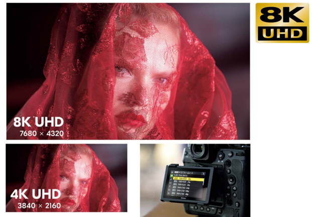
Fig. 4 Internal recording of 8K UHD/30p, 4K UHD video supported

has excellent resolving power, this setup delivers a high descriptive performance to every corner of the image. Moreover, 4K UHD/120p/60p/30p is supported to meet the diverse video production needs of video creators. The Z 9 can shoot 4K UHD/120p video without screen cropping, allowing video editing with the same angle of view even if the video is shot at different frame rates. The camera supports 12-bit RAW video including over 8K/60p that exceeds high-resolution 4K UHD/60p given by 8K oversampling. Nikon's original 10-bit N-Log, Hybrid Log-Gamma (HLG), and N-RAW recording are also supported. The ProRes 422 HQ recording format is supported to meet a wide range of video production needs. In addition, the detection of nine types of subjects is supported in movie recording.