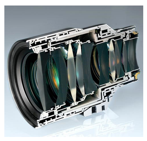
Fig. 4 Cut of cross-section.

The design keyword of Z Noct that aims to express the highest optical performance and quality is "craftsmanship". Because all the external parts are machined in metal and carefully finished one-by-one, it has both a high-quality texture and high part precision to maintain performance (Fig. 4). In addition, engraving the characters "Noct" in cursive style gives a special feeling that it has been made by a craftsman (Fig. 5) <sup>4</sup>.