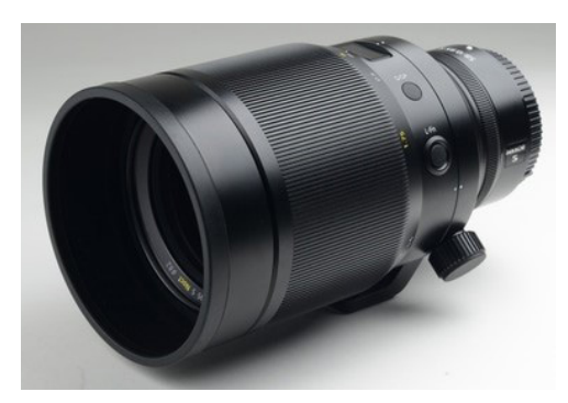
Fig. 6 Product appearance with hood attached <sup>5)</sup>.