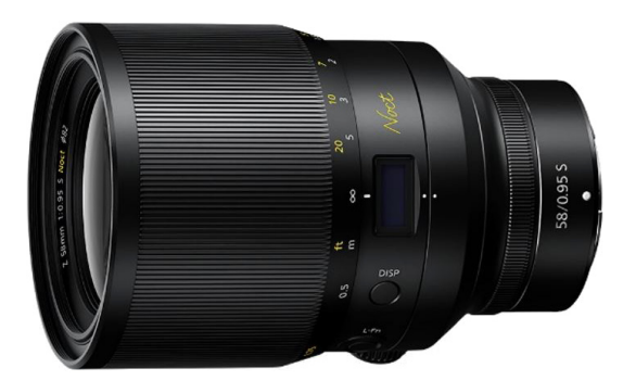
Fig. 1 NIKKOR Z 58mm f/0.95 S Noct.

The Nikon Z mount system lens "NIKKOR Z 58mm f/0.95 S Noct" was launched in October 2019 (Fig. 1).