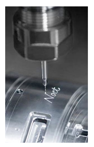
Fig. 5 "Noct" character engraving process.

In order to improve the finger grip, the focus ring has a wider pitch (perimeter) than the focus ring knurls of other NIKKOR Z lenses. If the pitch is made the same as that of other products, it will become slippery due to the large ring diameter. Further, by making the unevenness of the knurling clear, it was possible to give a more vivid impression. The