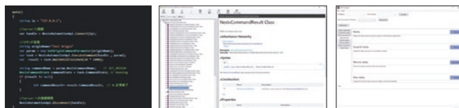
Sample of code

– A suite of tools makes it straight forward to build the routines.