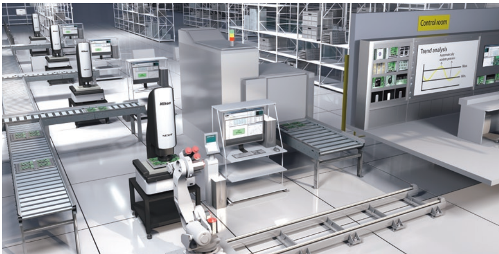
Illustrative example of "NEXIV" operation using "Remote Control SDK". Please take the appropriate safety measures when installing.

The remote control Software Development Kit (SDK) is a tool for developing user software modules to control and automate the NEXIV video measuring systems. Automate component carriers and measurement steps remotely or on the production floor by integrating NEXIV together with the component carrier conveyor system.